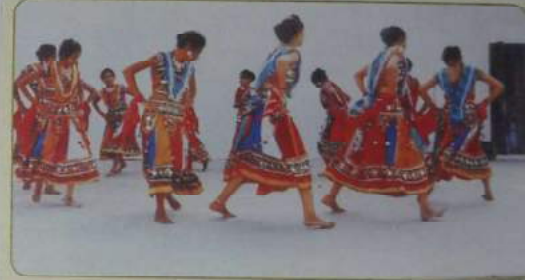
રજાન્યુઆરી પૂર્વયોજિત નૃત્ય