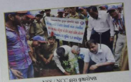
NSS / NCC દ્વારા વૃક્ષારોપણ