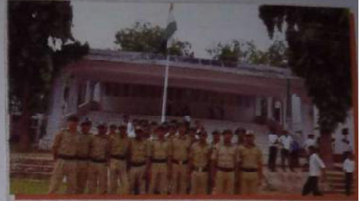
સ્વાતંત્ર્ય દિનની ઉજવણી કરતાં NCC કેંદ્રેટસ