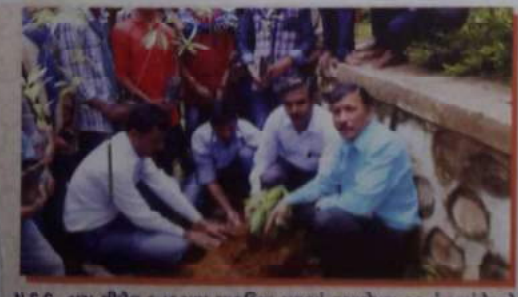
N.S.S. દ્વારા લીડેલ દલકગામ સાકરિયા ગામમાં વૃક્ષારોપણ કરતાં સ્વયંસેવકો