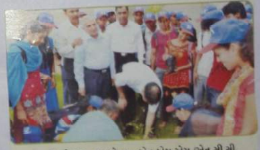
૧૫ મી ઓગસ્ટ - વૃક્ષારોપણ - એન.એસ.એસ./એન.સી.સી.