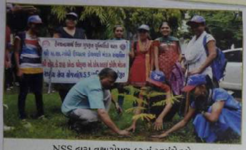
NSS દ્વારા વૃક્ષારોપણ કરતાં સ્વયંસેવકો