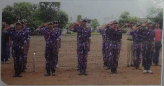
૧૫મી ઓગસ્ટ સ્વાતંત્ર્ય દિનની ઉજવણી