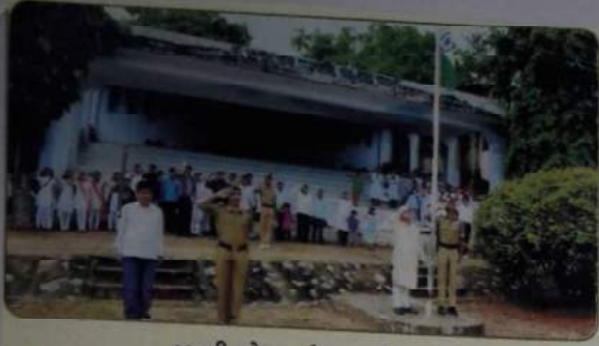
૧૫ મી ઓગસ્ટની ભવ્ય ઉજવણી