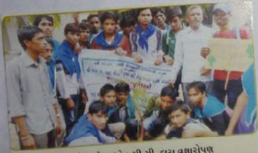
એન.એસ.એસ./એન.સી.સી. દ્વારા વૃક્ષારોપણ