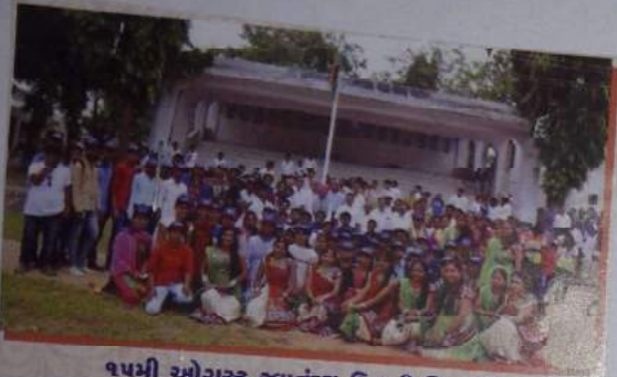
૧૫મી ઓગસ્ટ સ્વાતંત્ર્ય દિનની ઉજવણી